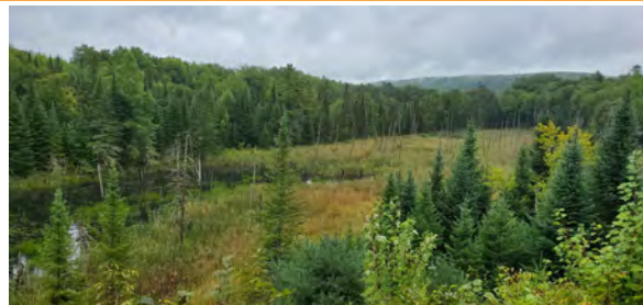
Scenic and Private Location