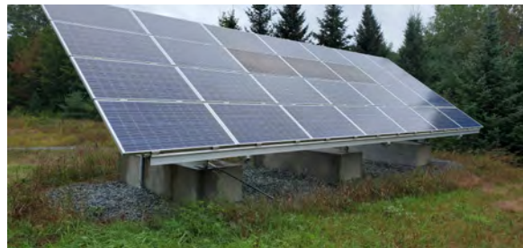
100% Solar Powered with Room for more Arrays!